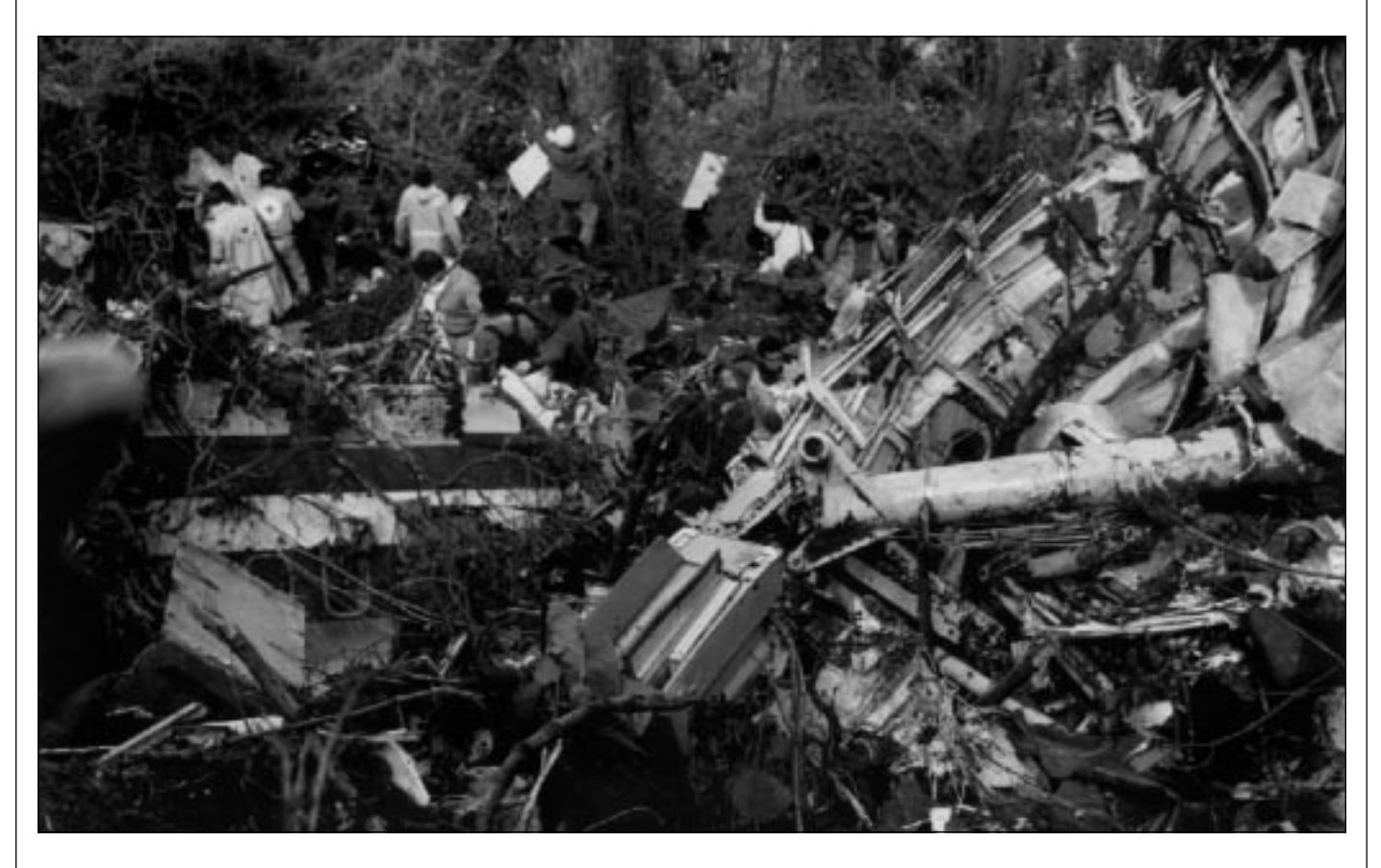
After the aircraft struck trees on the east side of a mountain ridge, the main wreckage of Flight 965 came to rest on the west side about 122 meters to 152 meters (400 feet to 500 feet) from the top.

At 2136:31, Cali Approach asked the crew if they were able to approach and land on Runway 19. After a brief discussion with the first officer, the captain replied that they would accept the approach to Runway 19, but would need a lower altitude immediately. The controller then cleared the flight for the VOR/ DME instrument approach to Runway 19 (Figure 1, page 4),