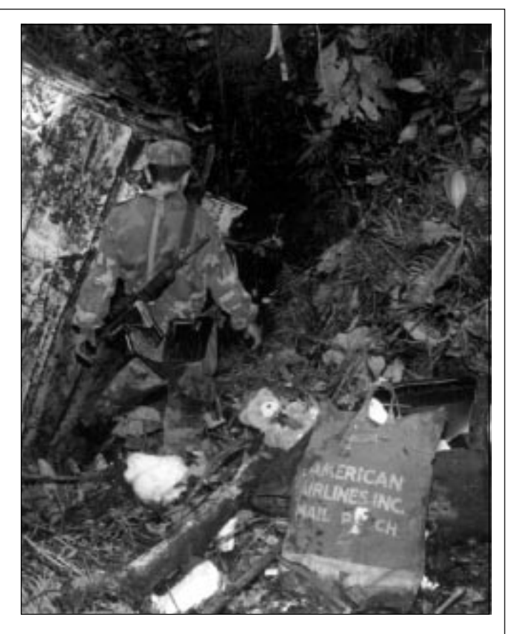
Search and rescue personnel were notified that Flight 965 was missing at 2150 hours, but it was not until after the wreckage was sighted at 0630 the next morning that search teams reached the site by helicopter.

At 2140:01, the captain told Cali Approach that they were "thirty-eight [nautical] miles" north of CALI VOR, and asked if they should proceed to TULUA and execute the ROZO One arrival to Runway 19. The controller replied that they could use Runway 19, and asked for their altitude and DME from